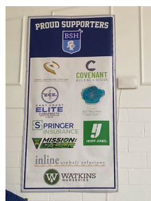
Parker Gym Wall Sponsor Banner