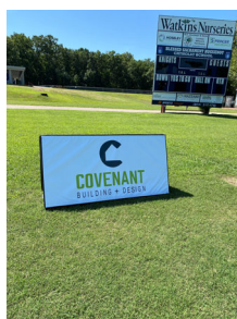
Field-level Sign, Large