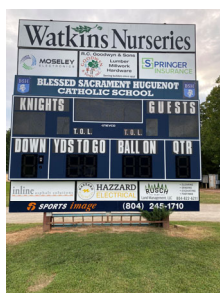
Barham-Sowers Field Scoreboard

One endzone tailgate spot at Barham-Sowers field for BSH home football games (does NOT include Homecoming game, spots assigned by AD as available)